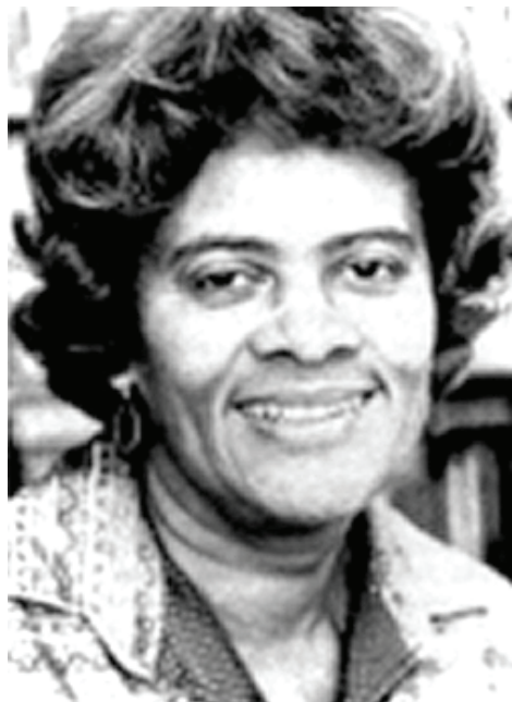
Evelyn Boyd Granville

Evelyn Boyd Granville (born May 1, 1924) was the second African-American woman to receive a Ph.D. in mathematics from an American University; she earned it in 1949 from Yale University (Attended Smith College before Yale).